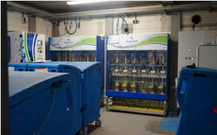
Above: (from top) a view of the plant's conventional wash aisle; employees feed garments into a sortation system; a view of the plant's chemical-injection system.

Nearby, employees sorted individual items and dropped them into one of two lines of 10 or more chutes. When full, a signal from the rail system moves the slings to a ceiling-storage area. There, they await processing in one of seven Lavatec Laundry Technology tunnel washers. When ready for processing, the computer sends the goods to an upper level where the tunnels are located. This equipment ranges from 9-20 compartments sized at 50 kg. (110 lbs.). Christeyns provides the plant's laundry chemistry. Clean wet goods emerge from the press at the end of each tunnel. Next, the textiles move by conveyor to any of 26, 60 kg. (132 lb.) Lavatec dryers. The plant's conventional wash aisle includes several Girbau washers of varying sizes. These are used for small lots and stain re-wash. There are also a number of pony dryers from various European manufacturers.